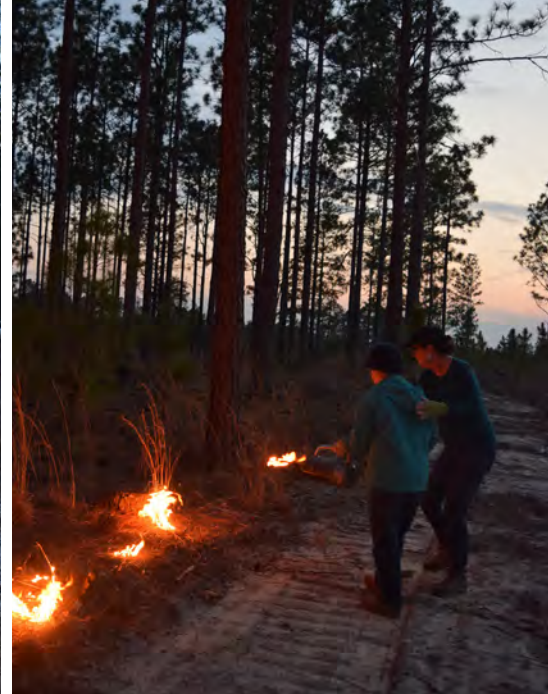
Passing the torch through three generations.